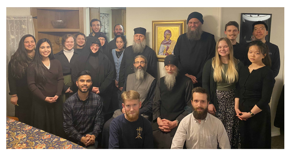
Participants in Saint Melanie's Night

possible for us to complete our education and not have to worry about finding appropriate housing. Saint Melanie's Student House is a beautiful space, and now that we are expecting a child, we feel at ease knowing that there is a safe place for him to walk and talk for the first time. Thank you!